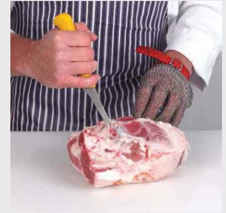
4. Remove the aitch bone.