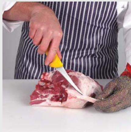
6. Trim off excess fat.