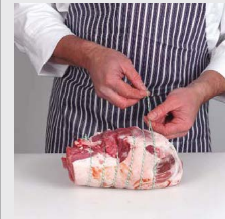
7. Roll and tie securely with string at regular intervals.