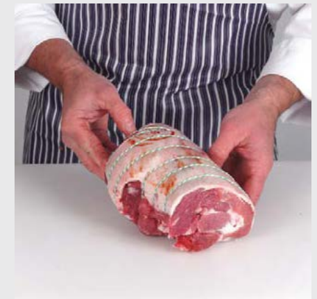
8. Boned and rolled leg prepared to specification.