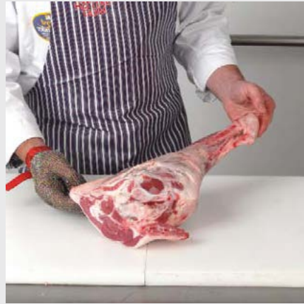
2. Leg without chump.