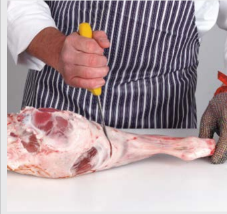
3. Remove the knuckle by cutting through the joint.