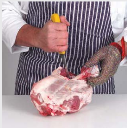
5. Remove the leg bone (femur) and kneecap (patella) by tunnel boning.